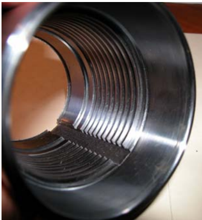
Typical gun end bore.